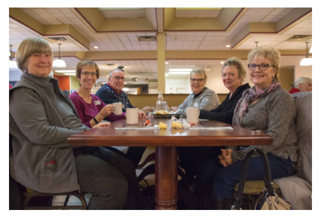
Having an "egg-citing" time at the PROBUS Breakfast meet.

Euchre: Third Thursday of the month from 1:00 - 4:00 pm. Games will be hosted in each other's homes on a rotating basis.