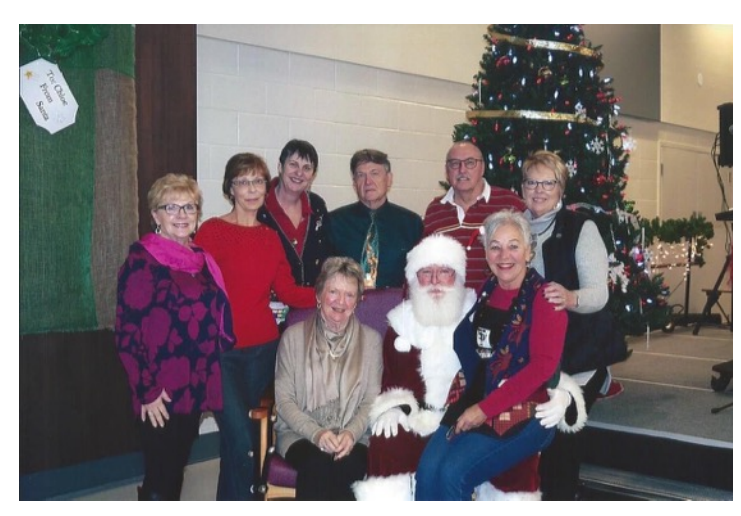
PROBUS members getting into the holiday spirit.